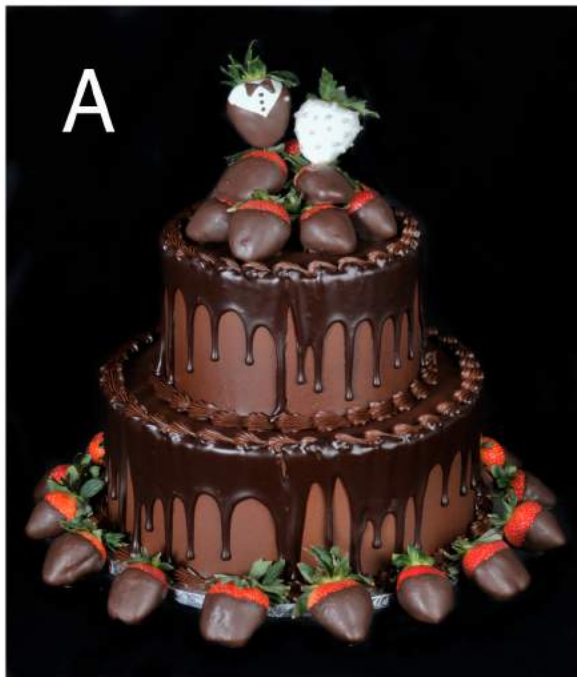
A 9" REAL (36 Servings)

Serves up to 162 servings. Please CHOOSE ONE Groom's Cake Design on the groom's cake can be changed to reflect the groom's interests. The cake shape and side details cannot be changed, however the party can purchase items to place on the cake, such as a football helmet, logo, patch, picture etc. Once the contract has been secured with the deposit, we will discuss the additions. All groom's cakes include 24 chocolate covered strawberries and the bride and groom chocolate strawberries. In the event that a groom's cake is NOT needed and the groom's cake servings are moved over to the bride's cake, the strawberries are NOT transferred.